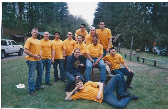
Navy Volunteers taking a break from working on the Waterfront