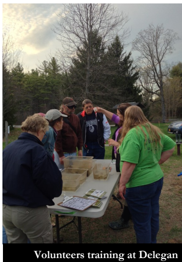
Volunteers training at Delegan