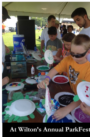
At Wilton’s Annual ParkFest

Collaborative Programs: We work with many organizations including the Saratoga Springs Public Library, BOCES, and Skidmore College Environmental Studies students.