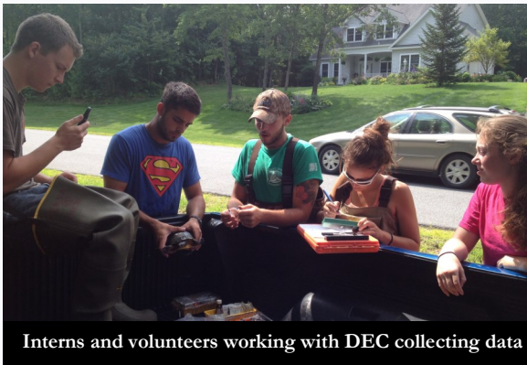
Interns and volunteers working with DEC collecting data