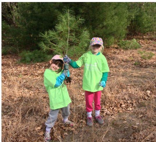
Hundreds of Girl Scouts from the area volunteered at Old Gick Farm as part of the Girl Scouts Give Back Week. They helped by removing small white pine trees which grow and eventually shade out the wild blue lupine in the meadow habitats.

Linda Baker Girl Scouts Give Back Week Larry Gordon* Andrea Marcuccio Navy Students Skidmore Environmental Studies Students *more than 200 hours