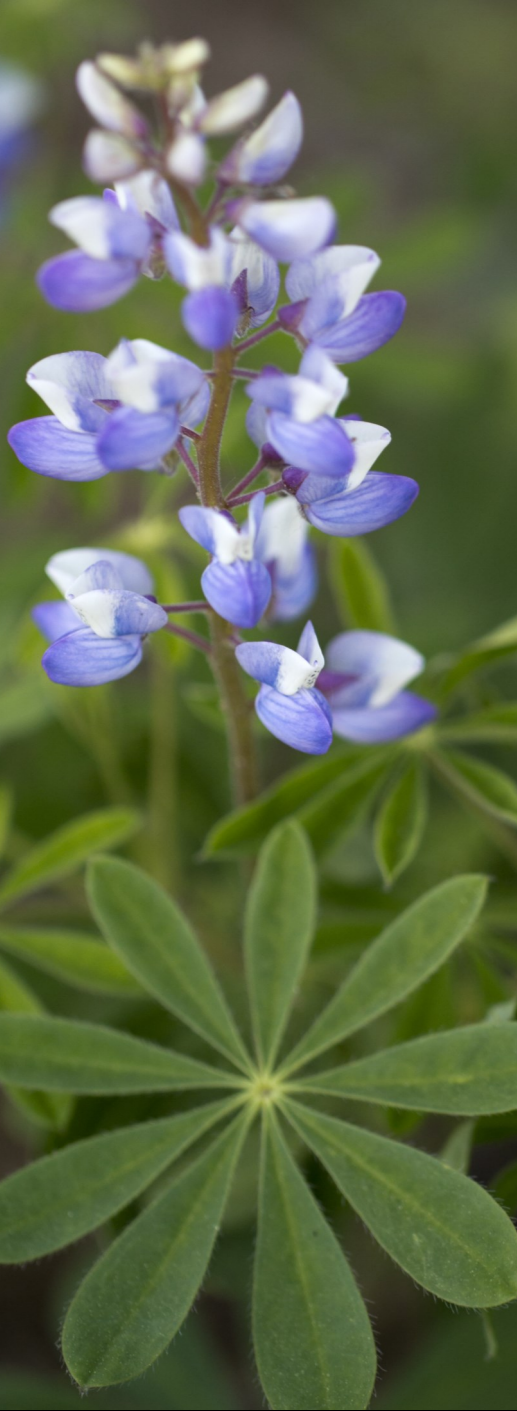
Blue Lupine